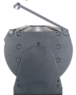
Integrated Gel / Frost Filter Slot