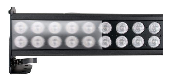
220° Manual Tilt Adjustable Mounting Brackets